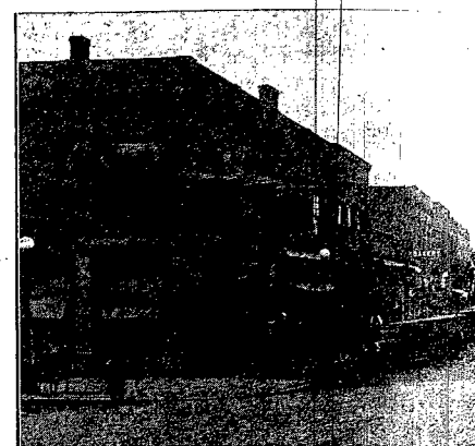
MAIN STREET, L.